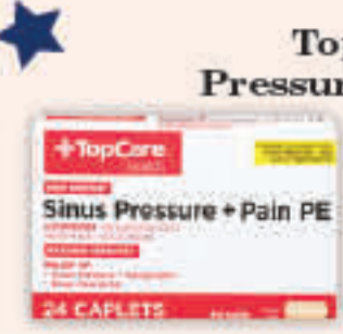
TopCare Sinus Pressure + Pain PE 24 ct.