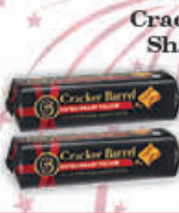
Cracker Barrel Sharp Cheese 8 oz., Selected Vty.