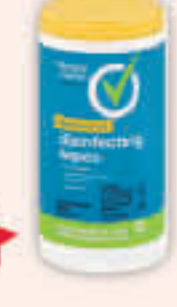
Simply Done Disinfecting Wipes 75 ct., Selected Vty.