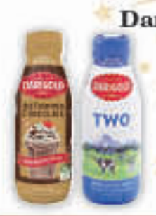
Darigold Single Serve Milk 14 oz., Selected Vty.