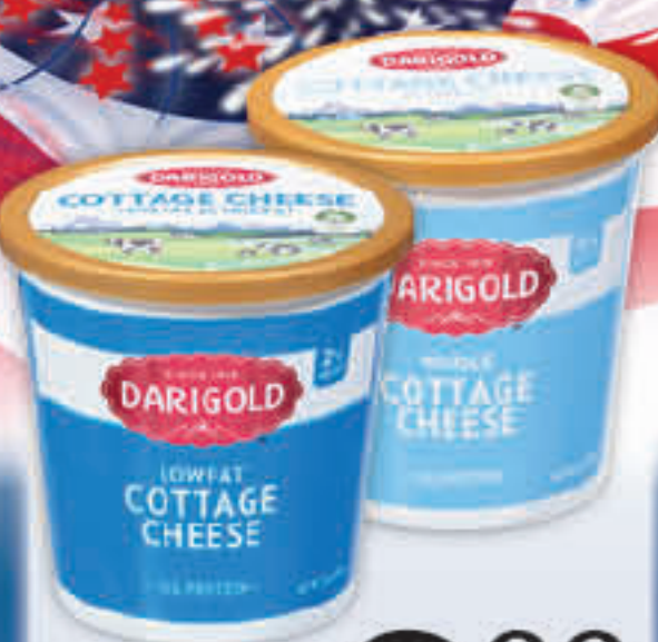
Darigold Cottage Cheese 24 oz., Selected Vty.