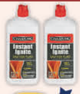
CharKing Lighter Fluid 32 oz.