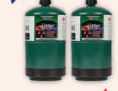
Bluefire Propane 16.4 oz.