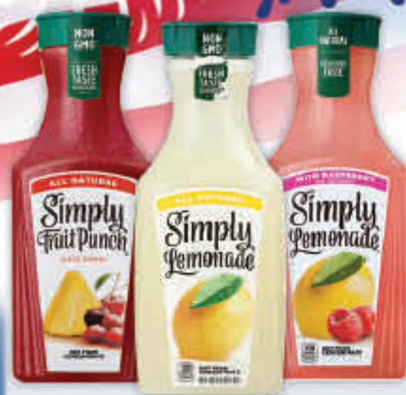
Simply Lemonade or Punch 52 oz., Selected Vty.