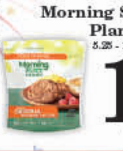
Morning Star Farms Plant Proteins 5.25 - 12 oz., Selected Vty.