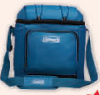
Coleman Soft Coolers 30 or 48 Quart