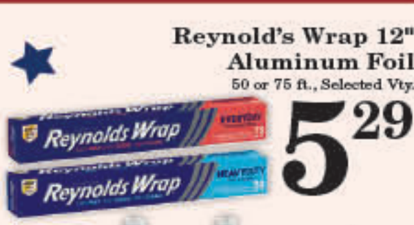
Reynold's Wrap 12" Aluminum Foil 50 or 75 ft., Selected Vty.