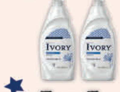
Ivory Dish Soap 24 oz.