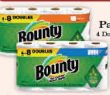
Bounty Paper Towels 4 Double Rolls, Sel. Vty.