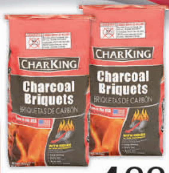
CharKing Charcoal Briquets 15.4 lb. Bag