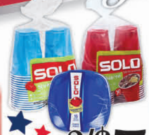
Solo Cups, Plates & Bowls 15 - 100 ct., Selected Vty.