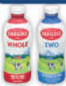
Darigold Milk 32 oz., Selected Vty.