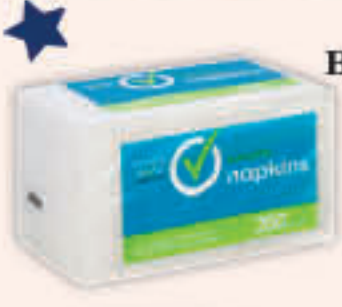
Simply Done Basic Napkins 250 ct., White