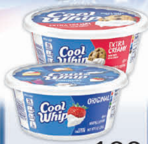
Cool Whip Whipped Topping 8 oz., Selected Vty.