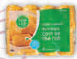
Food Club Corn on the Cob 8 ct. Half Ears