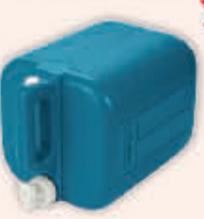
Coleman Chiller Carrier 5 Gallon