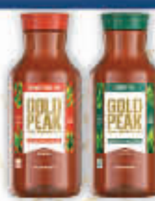
Gold Peak Iced Tea 52 oz., Selected Vty.