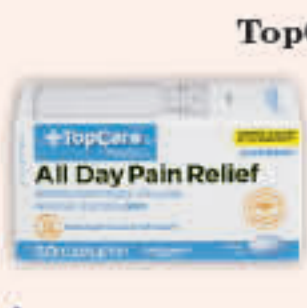
TopCare All Day Pain Relief 50 ct., Selected Vty.