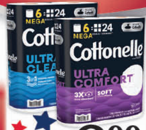
Cottonelle Ultra Bath Tissue 6 Mega Rolls, Selected Vty.