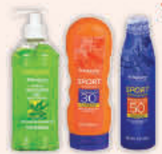
TopCare Sun Care 5.5 - 16 oz., Selected Vty.