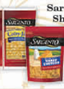
Sargento Cheese Shreds & Slices 5 - 8 oz., Selected Vty.