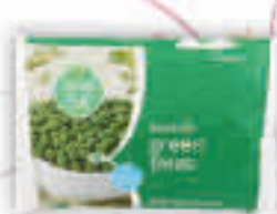
Food Club Vegetables 24 oz., Selected Vty.