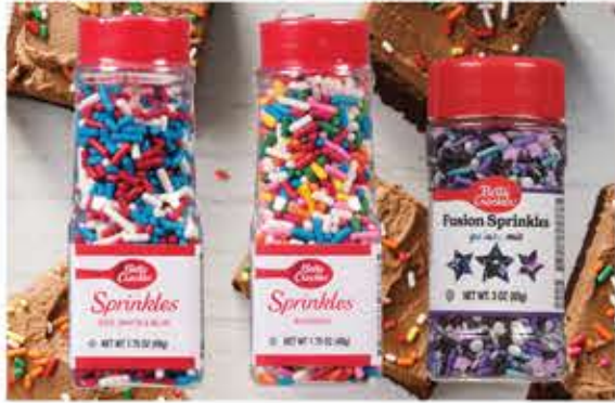
Betty Crocker Cake Decors Selected Vtys., 1.25 to 5.1-oz.