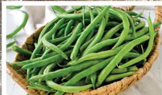
Fresh Green Beans