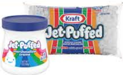
Jet-Puffed Mini Marshmallow or Creme 7 to 10-oz.

Jell-O No Bake Cheesecake Cherry or Strawberry 17.8 to 19.6-oz. 369