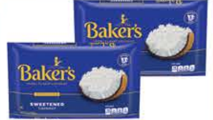
Baker's Angel Flake Sweetened Coconut 14-oz.