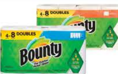
Bounty Paper Towels Select-A-Size or Full Sheets 4-Double Rolls