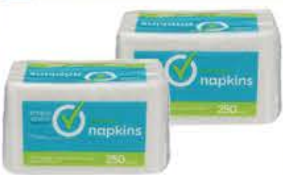
Simply Done Everyday Napkins 250-ct.