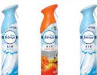
Febreze Air Freshener Spray Selected Vtys., 8.8-oz.