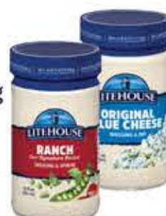
Litehouse Salad Dressing Selected Vtys., 13-oz.