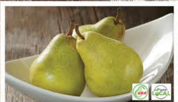
Bartlett Pears Northwest Grown