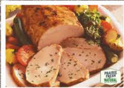
Boneless Pork Loin Roast

Roxy Whole Chicken Northwest Grown 3 79 lb.