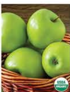
Organic Granny Smith Apples Northwest Grown