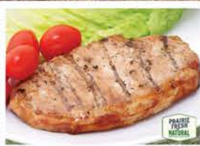
Boneless Pork Loin Chops