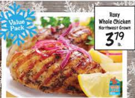
Draper Valley Farms Bone-In Half Chicken Breast Value Pack Northwest Grown