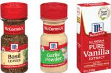
McCormick Spices or Extracts Selected Vtys., .12 to 6-oz.