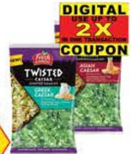
Fresh Express Chopped Kits Selected Vtys., 9.3 to 13-oz.

SALE PRICE 3 99 COUPON -1 00 2 99 ea. FINAL