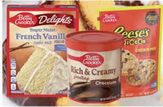
Betty Crocker Frosting, Cake, or Cookie Mix Selected Vtys., 11.9 to 16-oz.