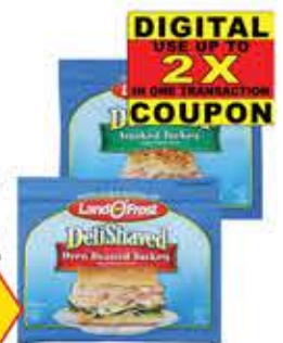
Land O'Frost Delishaved Lunchmeat Selected Vtys., 9-oz.

SALE PRICE 3 99 COUPON -2 00 1 99 ea. FINAL