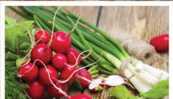
Radishes or Green Onions