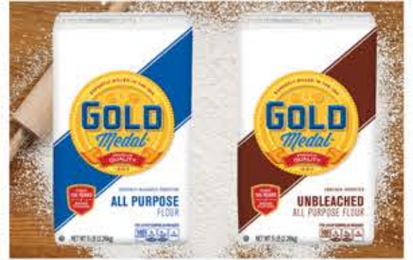
Gold Medal All Purpose Flour Bleached or Unbleached 5-lbs.