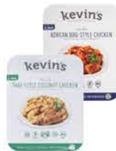
Kevin's Chicken Entrées Selected Vtys., 16-oz.