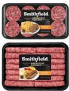
Smithfield Hometown Original Breakfast Sausage Links or Patties 12-oz., Frozen