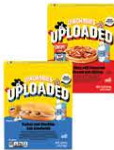
Oscar Mayer Uploaded Lunchables Selected Vtys., 13.9 to 15.1-oz.