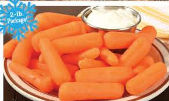
Peeled Mini Carrots 2-lb. Package