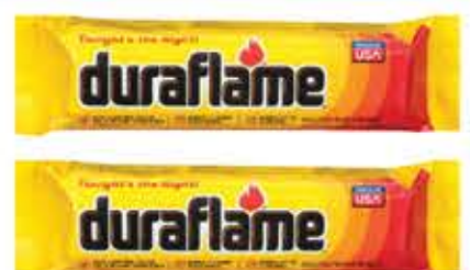
Duraflame Firelog 6-lbs.