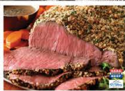
Boneless Beef Top Sirloin Roast USDA Choice