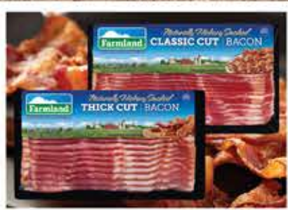
Farmland Bacon Selected Vtys., 16-oz.