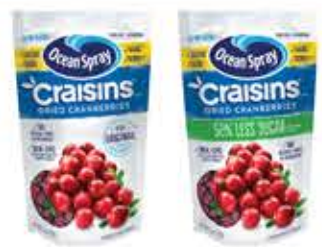
Ocean Spray Craisins Original or Less Sugar 5 to 6-oz.