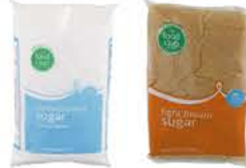
Food Club Powdered or Brown Sugar Selected Vtys., 2-lbs.