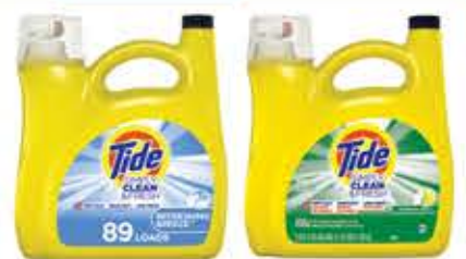
Tide Simply Liquid Laundry Detergent Refreshing Breeze or Daybreak Fresh 128-oz.