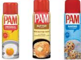
Pam Cooking or Baking Spray Selected Vtys., 5 to 6-oz.