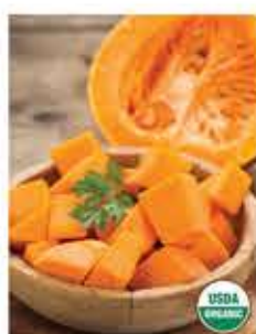
Organic Butternut Squash