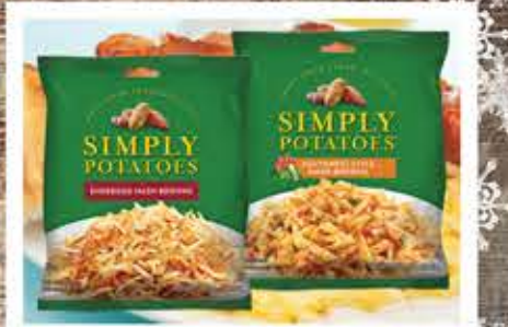
Simply Potatoes Selected Vtys., 20-oz.