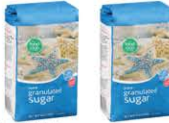
Food Club Pure Granulated Sugar 4-lbs.