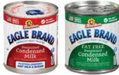
Eagle Brand Sweetened Condensed Milk Regular or Fat Free 14-oz.