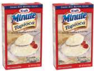
Kraft Minute Tapioca 8-oz.