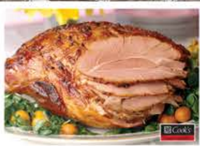
Cook's Bone-In Shank Portion Ham