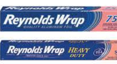
Reynolds Wrap Aluminum Foil Selected Vtys., 50 to 75-sq. ft.