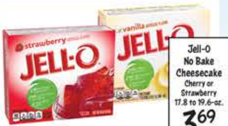
Jell-O Gelatin or Pudding Cups Selected Vtys., .6 to 6-oz.