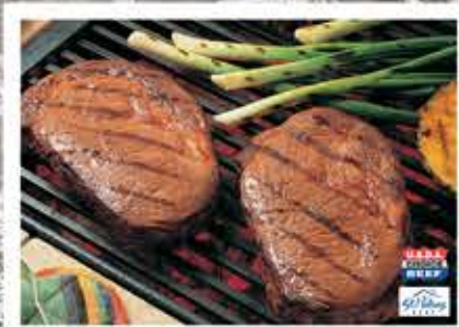
Boneless Beef Ribeye Steak USDA Choice