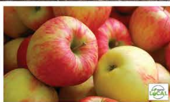
Honeycrisp Apples Northwest Grown Washington Extra Fancy