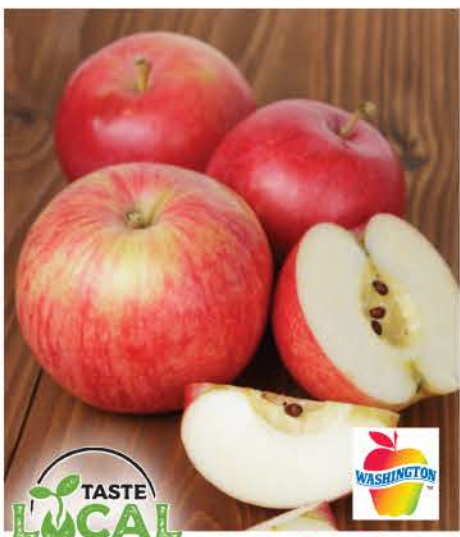
Gala Apples Washington