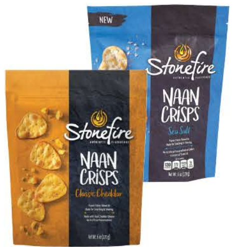
Stonefire Naan Crisps Selected Vtys., 6-oz.