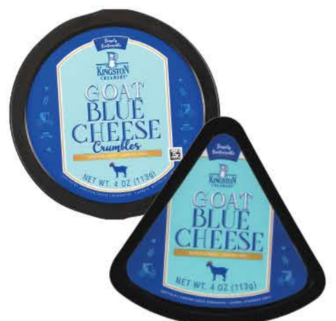
Kingston Creamery Cheese Selected Vtys., 4-oz.