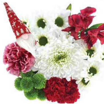
Gnome for the Holidays Bouquet