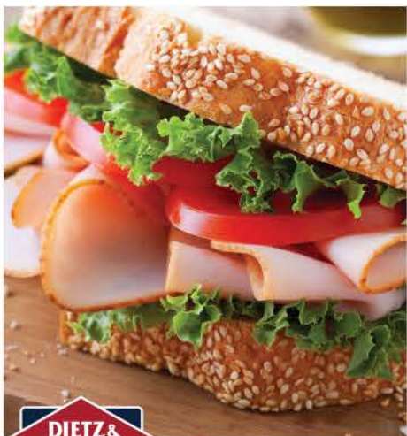
Black Forest Ham