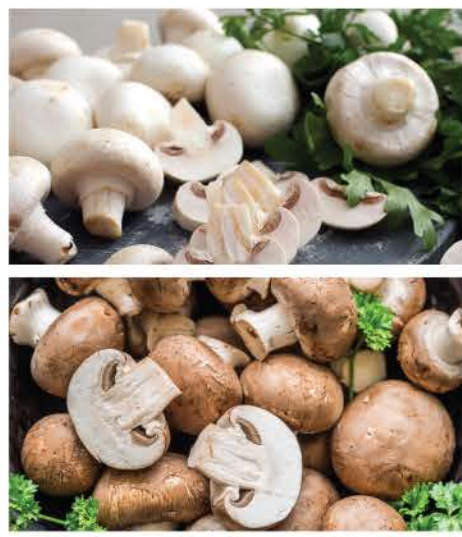
White or Crimini Mushrooms