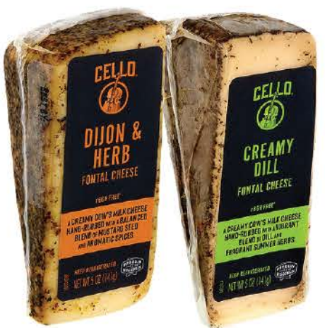
Cello Fontal Cheese Selected Vtys., 5-oz.