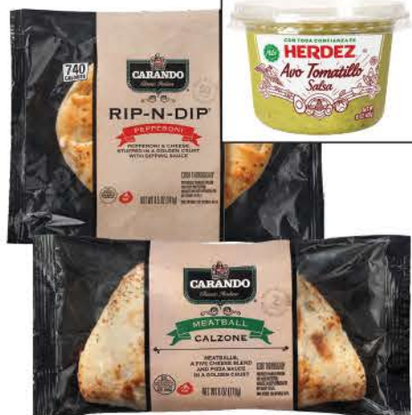
Carando • 6-oz. Calzone • 8.5-oz. Rip-N-Dip Selected Vtys.