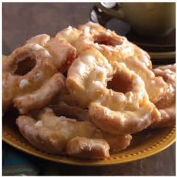
Old Fashioned Cake Donuts 8-ct., 20-oz. Package