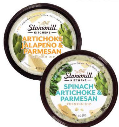
Stonemill Kitchens Premium Dips Selected Vtys., 10-oz.