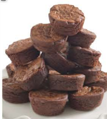
Brownie Bites 19-oz. Package