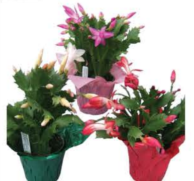
4-Inch Zygo Cactus Selected Vtys.