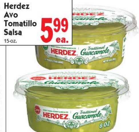
Herdez Avo Tomatillo Salsa 15-oz.