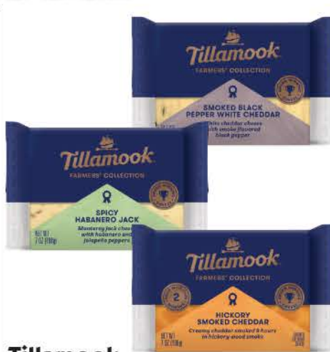
Tillamook Farmers' Collection Cheese Selected Vtys., 7-oz.