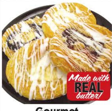
Gourmet Danish Pastry Selected Vtys., 4-ct., 18-oz. Package