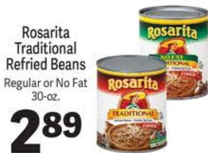
Rosarita Traditional Refried Beans Regular or No Fat 30-oz.