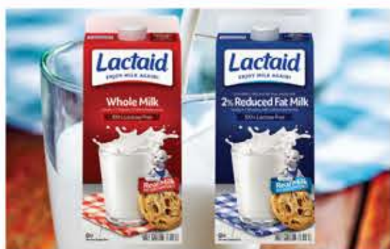
Lactaid Lactose Free Milk Selected Vtys., 64-oz.