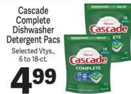
Cascade Complete Dishwasher Detergent Pacs Selected Vtys., 6 to 18-ct.