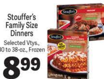
Stouffer's Family Size Dinners Selected Vtys., 30 to 38-oz., Frozen