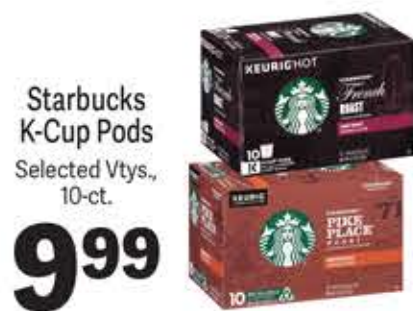
Starbucks K-Cup Pods Selected Vtys., 10-ct.