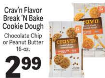
Crav'n Flavor Break 'N Bake Cookie Dough Chocolate Chip or Peanut Butter 16-oz.