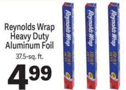
Reynolds Wrap Heavy Duty Aluminum Foil 37.5-sq. ft.