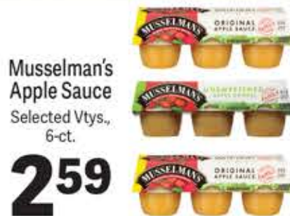
Musselman's Apple Sauce Selected Vtys., 6-ct.