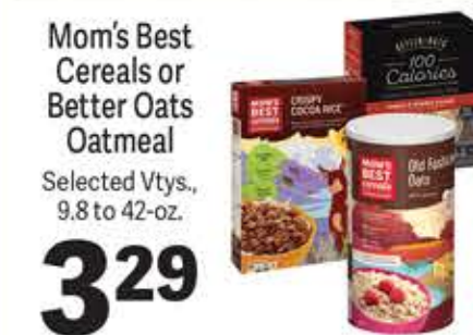
Mom's Best Cereals or Better Oats Oatmeal Selected Vtys., 9.8 to 42-oz.