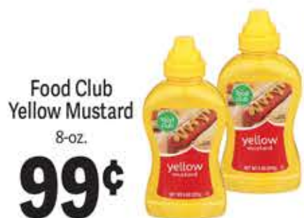
Food Club Yellow Mustard 8-oz.