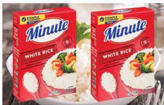
Minute White Rice 42-oz.