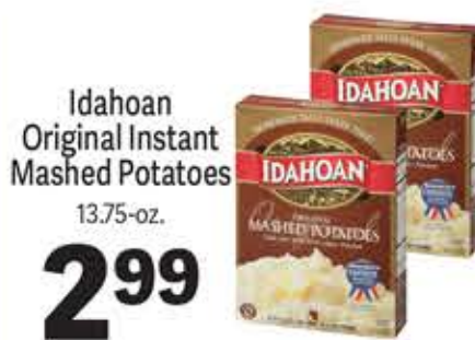
Idahoan Original Instant Mashed Potatoes 13.75-oz.