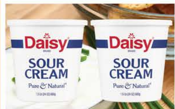
Daisy Sour Cream 24-oz.