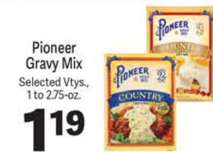
Pioneer Gravy Mix Selected Vtys., 1 to 2.75-oz.