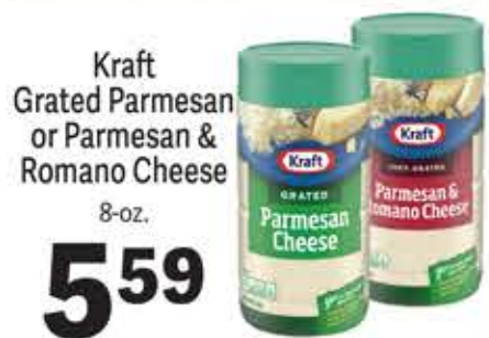
Kraft Grated Parmesan or Parmesan & Romano Cheese 8-oz.