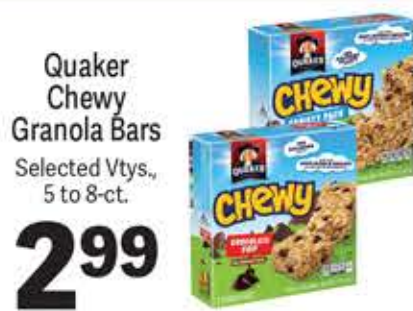
Quaker Chewy Granola Bars Selected Vtys., 5 to 8-ct.