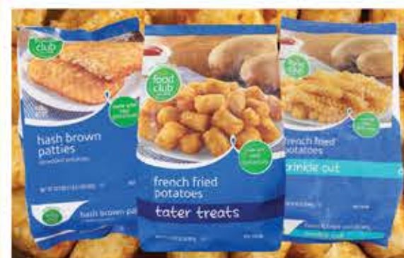
Food Club Potatoes Selected Vtys., 22.5 to 32-oz., Frozen