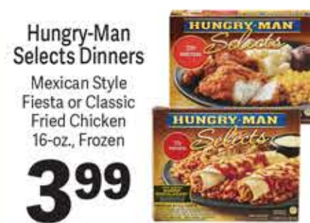
Hungry-Man Selects Dinners Mexican Style Fiesta or Classic Fried Chicken 16-oz., Frozen