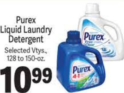
Purex Liquid Laundry Detergent Selected Vtys., 128 to 150-oz.