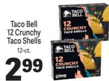
Taco Bell 12 Crunchy Taco Shells 12-ct.