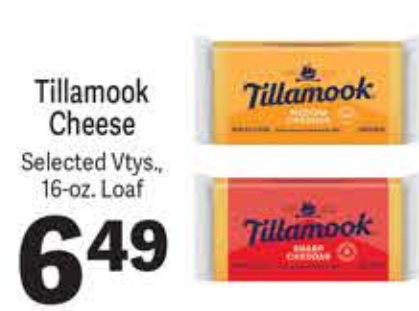
Tillamook Cheese Selected Vtys., 16-oz. Loaf