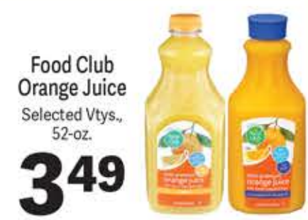
Food Club Orange Juice Selected Vtys., 52-oz.