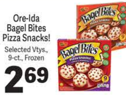
Ore-Ida Bagel Bites Pizza Snacks! Selected Vtys., 9-ct., Frozen