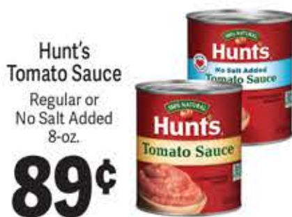
Hunt's Tomato Sauce Regular or No Salt Added 8-oz.