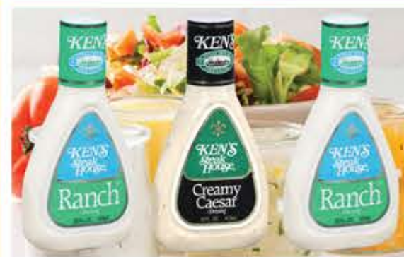
Ken's Steak House Dressing Selected Vtys., 16-oz.