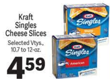
Kraft Singles Cheese Slices Selected Vtys., 10.7 to 12-oz.