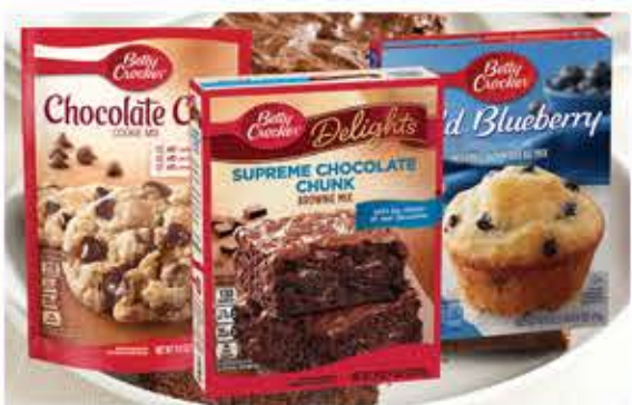
Betty Crocker Brownie, Muffin or Cookie Mix Selected Vtys., 16 to 19.1-oz.