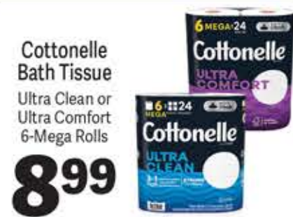
Cottonelle Bath Tissue Ultra Clean or Ultra Comfort 6-Mega Rolls