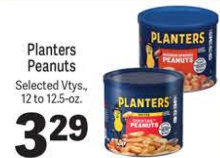
Planters Peanuts Selected Vtys., 12 to 12.5-oz.