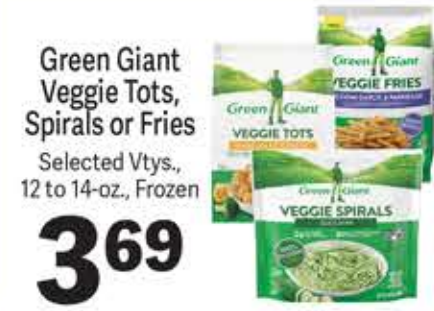
Green Giant Veggie Tots, Spirals or Fries Selected Vtys., 12 to 14-oz., Frozen